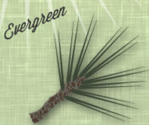
TWO NEEDLE PINE